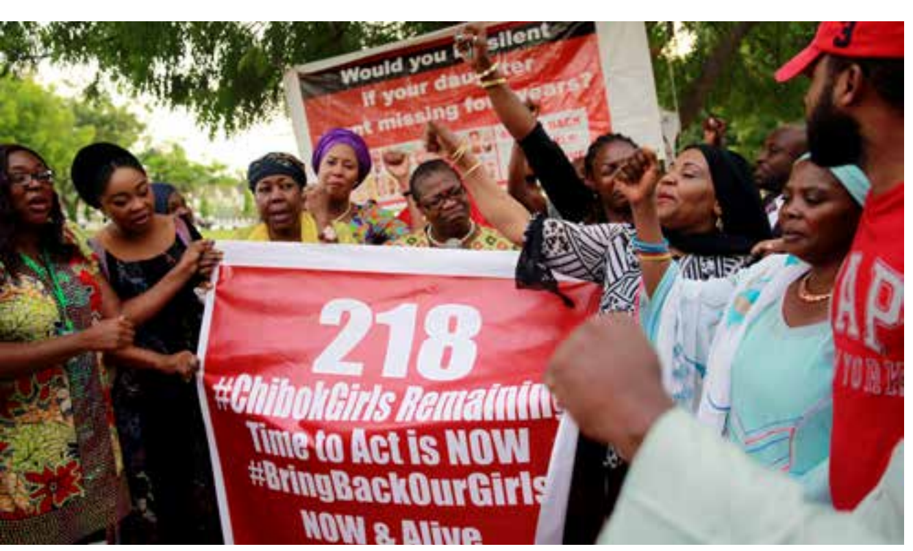
Members of the #BringBackOurGirls campaign during a sit-out in Abuja, Nigeria, May 18, 2016, after receiving news that a teenager kidnapped by Boko Haram from her school in Chibok more than two years earlier had been rescued.

This complex structure also makes it exceedingly difficult to find comprehensive data, as each ministry or agency has, at best, only a piece of the overall picture. A representative of the Ministry of Reconstruction, Rehabilitation and Resettlement (MRRR), which was created in 2015 to oversee the rebuilding and resettling of Boko Haram victims in Borno state, observed that "the data [to assess the impact of security improvements in schools] are not easily accessible. They are scant and scattered among the various ministries and agencies." The representative also pointed out that it is difficult to get a concrete overview of the expenditures made for school