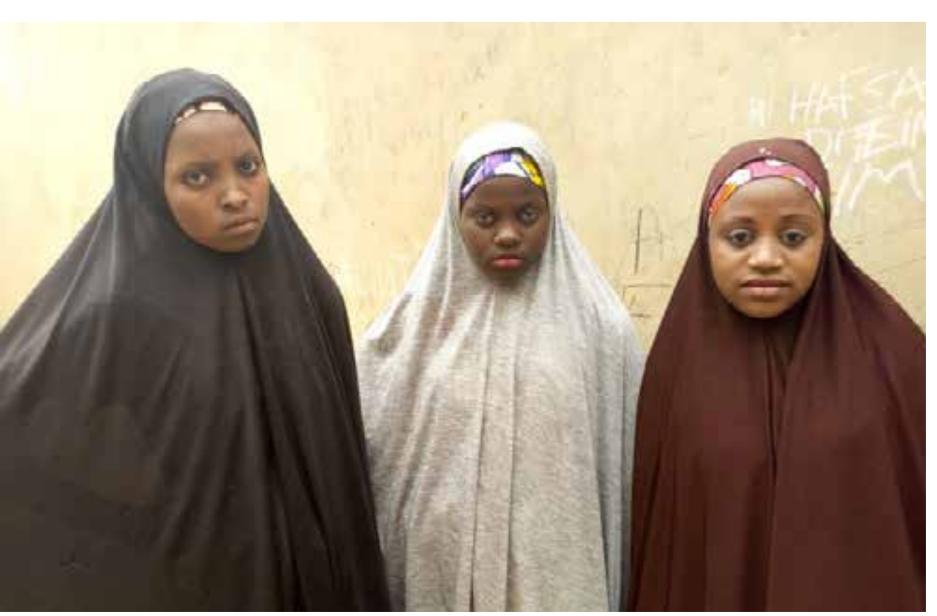
Students who were abducted in February 2018 from their school in Dapchi, Nigeria, and spent a month in captivity.

Several female students described hearing gun shots when Boko Haram insurgents stormed the school grounds and seeing men in military uniforms. The girls initially thought that they were being rescued after the attack on the town, but they discovered that the men were actually Boko Haram fighters when one spoke on the phone in Kanuri<sup>81</sup> to request a vehicle to transport the girls.