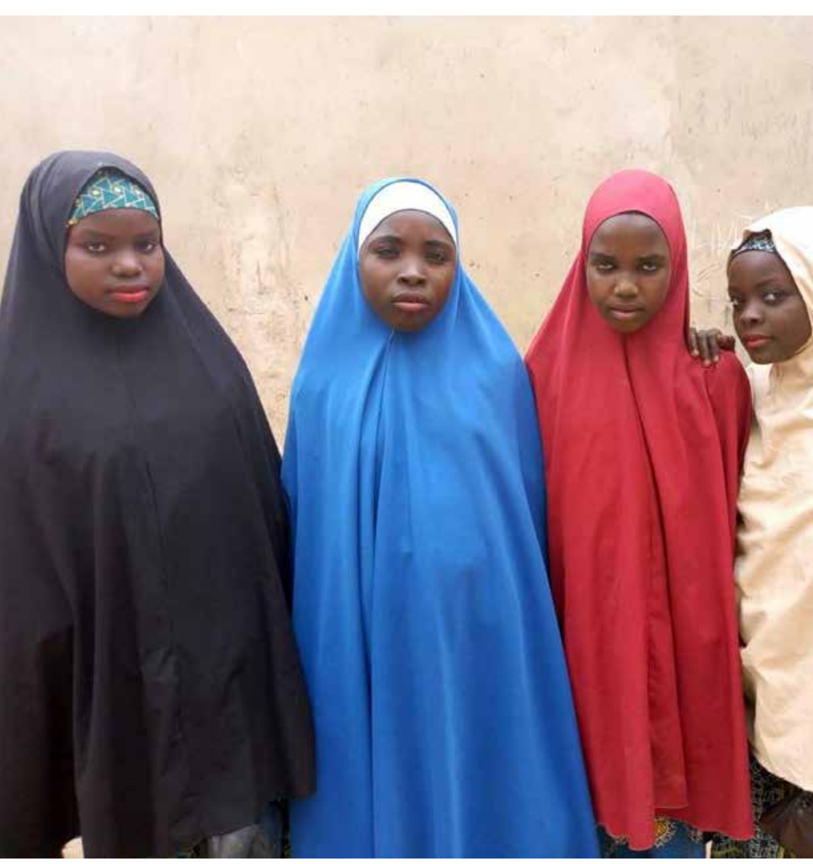
Students who were abducted in February 2018 from their school in Dapchi, Nigeria, and spent a month in captivity.